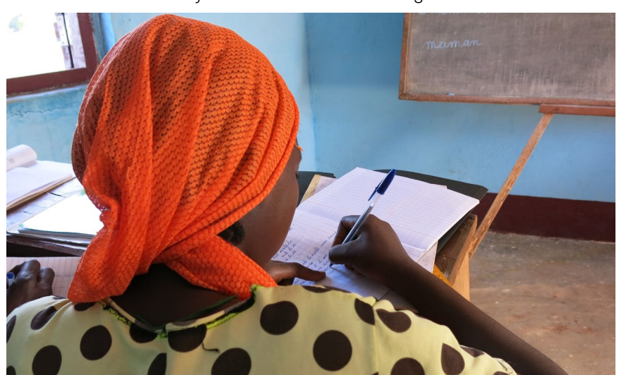
A young woman follows a literacy class at the Women's Home in Bria, in the heart of the Central African Republic, which offers education to survivors of violence.