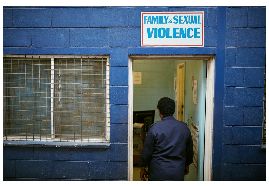
In Papua New Guinea: Marie* investigates gender-based crimes.

Outside of their homes, women were regularly forced to disobey curfews, lockdowns or stay-at-home orders due to their need to earn a living, to find food and water for their households, or to perform the care work society disproportionately expects of them and which, also increased during the pandemic. 18 More than 90% of women workers in developing countries are employed in the informal sector, 19 lacking employment protections and social safety nets such as coronavirus relief payments. With little choice but to continue working, they faced harassment and brutalization by police and military authorities enforcing coronavirus control measures such as checkpoints, quarantines and curfews. 20 Equally, in sectors of the workforce where women, including trans women are overrepresented, such as the domestic work and healthcare sectors, workers have seen dramatic increases in violence, 21 as have migrant women workers, isolated with their employers and unable to reach family and support networks. 22